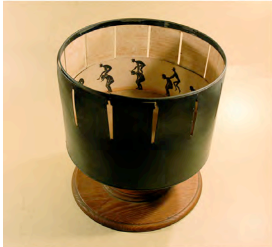
a pre-cinema zoetrope, circa 1845 (Albin O. Kuhn Library collection, UMBC)