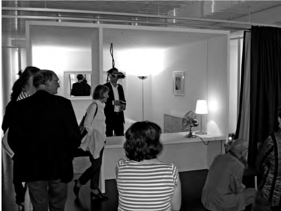
Exhibition at the Museum of Communication in Bern, Switzerland, July 2007

'Ecosystem' transforms the audience into a 'Fremdkörper' in its own environment. It invites visitors to delve into an obscure ecosystem inhabited by virtual, abstract creatures that interact with them and eventually take control of the room. In this artificial space, 'Ecosystem' confronts us with our alienation from nature.