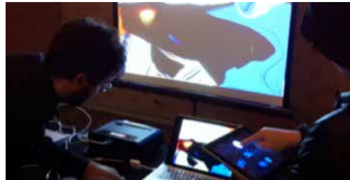
Figure 2: Multiple users collaborate at an installation of the Fluid Automata project.

Fluid Automata has been presented in a number of different environments, emphasizing different aspects of the project. For instance, one installation emphasized the collaborative experience, inviting multiple users to participate in shaping and interacting with a single system that was projected large-scale. Fluid Automata has also been used as a visual instrument to provide live accompaniment to a dynamic musical composition. The most current iteration will be installed in the AlloSphere Research Facility, a spherical virtual reality environment housed in the California NanoSystems Institute at the University of California, Santa Barbara [8]. In this project, the multi-touch, gyroscope, and accelerometer sensors in the tablet interface are used to navigate and interact with a 3D fluid system projected on the upper hemisphere of the AlloSphere. That is, although this project was initially created as a multimedia artwork, it also functions as contributing research to virtual environment visualization and interaction techniques. Below we describe the design choices and algorithms general to the previous installations.