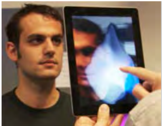
Figure 4: An example using a live video feed as the base texture for the image processing.

The main image processing scheme is based on a feedback loop whereby a high-resolution background image is perpetually blended together with a distorted version of itself. The characteristics of the distortion are based directly on the current state of the fluid system. This system is similar to Image Base Flow Visualization, which has been extended for use in a variety of scientific visualization applications, including animated and 3D flows [1]. Again, since the focus of the application is aesthetic exploration, we provide the user with a variety of tools to alter aspects of these blending operations. In addition, introduce an image processing layer whereby the user can change a variety of parameters, including: the rate and amount of blending, the