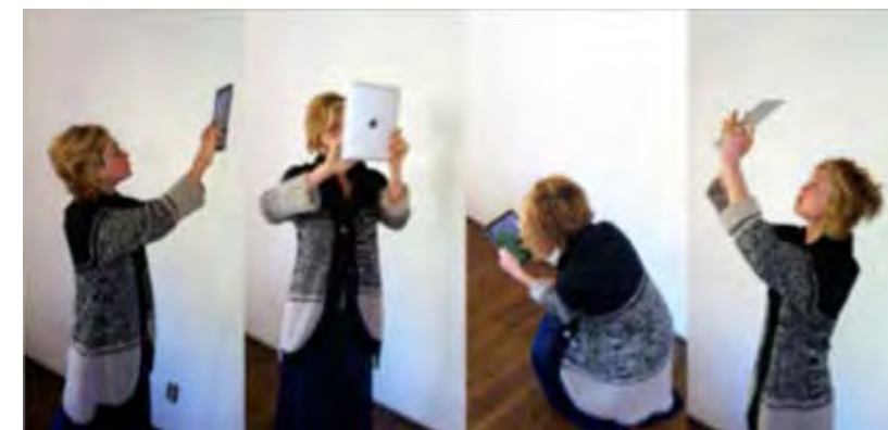
Figure 6: A participant uses the iPad to explore the virtual fluid space.

Audio-visual composition – A version of Fluid Automata has been created for use as an instrument in an audio-visual composition. In this configuration the application is to be mirrored onto large display. In addition to being controlled by multi-touch, the system can respond to Open Sound Control (OSC) messages sent by the composition computer, for instance, to respond to musical events. Additionally, fluid data can be transmitted wirelessly via OSC to influence the composition. We have also experimented with attaching piezo sensors to the iPad itself in order to directly input data into the algorithmic composition engine.