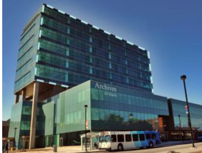
Fig. 3. Archives of Ontario: Dramatizing the Archive (projection area), Dave Colangelo and Patricio Davila, Installation.