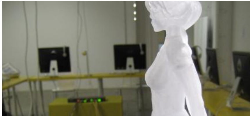
Figure 1. Wanderingfictions Story as part of the Meta-Dreamer project at the Golden Thread Gallery, Belfast (2009) Digital Object.

This paper presents a framework for what is termed 'the emergent imagination' (developed through a recent PhD thesis) that arises out of the transitional spaces created in avatar-mediated online space; and argues that the conditions for 'the emergent imagination' are best generated where the experience of space is heterogeneous and where the plasticity of time-space relationships is articulated.