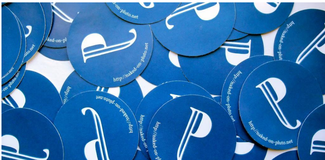
Fig. 2. Naked on Pluto stickers, 2010, Dave Griffiths, Aymeric Mansoux & Marloes de Valk, photo, Free Art License