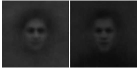
Figure 2. Shinseungback Kimyonghun, Portrait (Taxi Driver and Bourne Identity) (2013)

In Portrait (2013), Shinseungback Kimyonghun used computer vision in the statistical style of Jim Campbell and Jason Salavon (Figure 2). The software detects faces in every 24 th frame of a selected movie, averages and blends them into one composite with the dominant facial identity of a movie, stressing the figurative paradigm in mainstream cinema (Shinseungback, 2013).