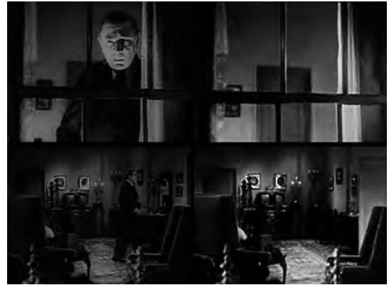
Figure 4. Martin Arnold, Deanimated (2002): corresponding stills Invisible Ghost (left) and Deanimated (right)

One of the most impressive critical deconstructions of the structural and audiovisual conventions in cinema was achieved by Martin Arnold with Deanimated (2002) (Figure 4).