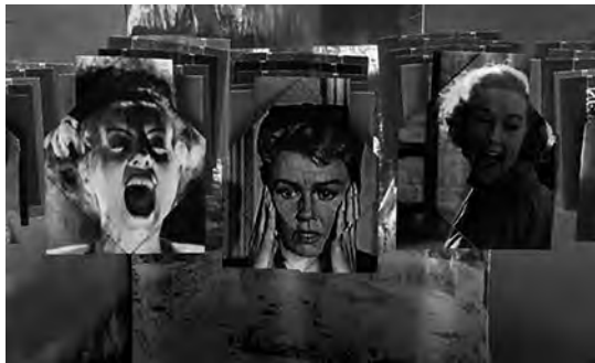
Figure 6. Virgil Widrich, Fast Film (2003). animated effect, visually resembling Arcimboldo's grotesque pareidolic compositions (Pagden, 2007)

In Fast Film (2003), Virgil Widrich intelligently expanded the possibilities for reproducing and interpreting the film snippets in order to accentuate the fascinations, obsessions and stereotypes of conventional cinema (Figure 6).