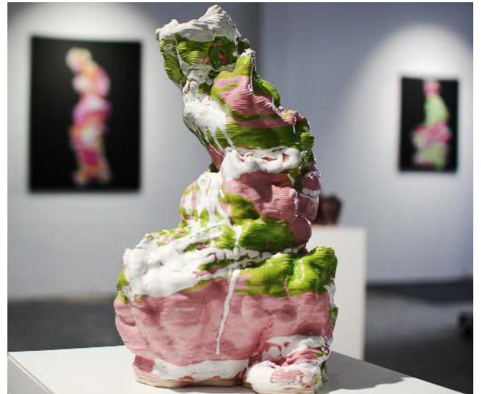
Figure 3. Ceramic sculpture guided by 3D object and text prompt, 3D printed in clay, and glazed manually. ©Varvara & Mar.

In the end, we can say that AI is not prepared for the physical world. It created nice images, but when one wants to materialise the output, it requires considerable additional work. However, those extra processes were very rewarding and creative in our case. In this project, AI served as an inspiration or a departing point more than anything else. In other words, the experimental phase of technology is necessary for experimental practices, and this can lead to the creation of a new production pipeline. The fine line between control and chance when guiding the neural networks and related processes is likely the main creative drive for the artists.