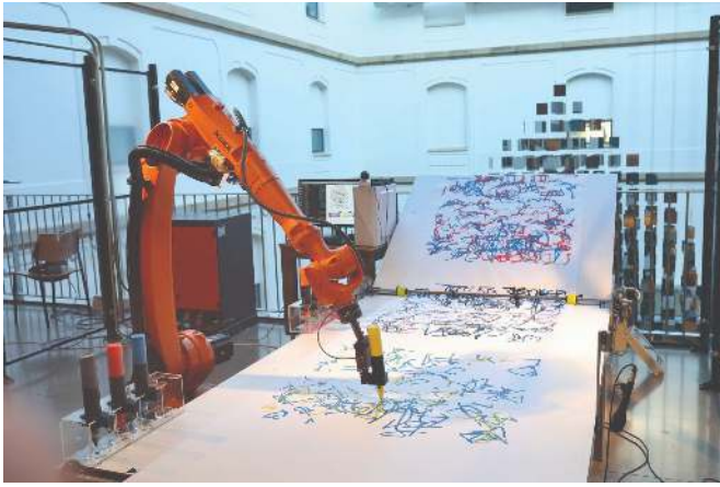
Figure 2. Kuka industrial robot painting audience's dreams. Installation view of Dream Painter. ©Varvara & Mar.

Following the same paradigm shift as in the previous section, text2mesh is a CLIP-based model that does not require a dataset, but a 3D object and text prompt as input. 34 Hence, the model actually does not create a 3D model but stylises the inserted one, guided by inputted text.