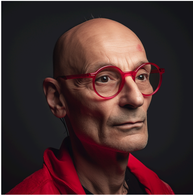
Figure 3. EE Journal #4: Art After AI, AI generated portrait of AI generated fictional artist David Clarke.

intending to continue to create physical paintings in his style after he passes away.” The fictional interview with Clarke uncovers his personal story, life struggles, and, consequently, how his situation has been affected by the AI tools. This is one of the positive stories in the “Art after AI” issue, pointing to the fact that AI can potentially extend the boundaries of what it means to be an artist, but the story is not without an internal conflict. The AI-generated persona speculates on a future scenario where the “art market may become saturated with AI-generated replicas of dead artists, creating a new wave of authenticity debates and challenging the traditional notions of what constitutes “original” art.” This is just one example of a myriad of personas and stories generated by the AI for the EE magazine, reflecting the potential for AI tools, such as ChatGPT, to be used for carefully knitted storytelling.