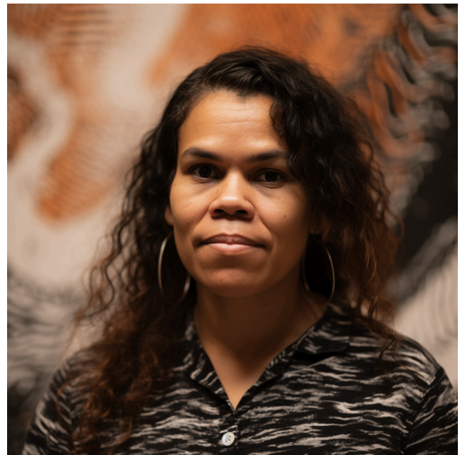
Figure 1. EE Journal #4: Art After AI, AI generated portrait of AI generated fictional artist Yirrkala Dhunba.

Midjourney's take on the topic of AI and indigenous communities through the interview “Gene-Editing the Indigenous.” In response to our request for a unique, cutting-edge, innovative take on AI by an indigenous artist, ChatGPT invented a detailed profile and artistic endeavors of an indigenous artist named Yirrkala Dhunba. This was the proposed artwork by ChatGPT for Yirrkala: “Indigenous Genomic Adaptation explores AI and gene-editing techniques to discover potential genetic adaptations to Indigenous people, making them more resistant to the changing climate.” [11] Further, the resulting texts were used to visualize Yirrkala through Midjourney.