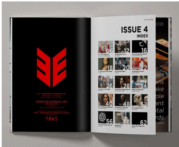
Figure 2. EE Journal #4: Art After AI, Index page.

The topic-generation process was initiated through an open conversation with ChatGPT about the desire to create a magazine centered around the theme of AI and the polarized views around it. ChatGPT provided a list of potential themes from which the most pertinent were selected. These topics were then channeled into either articles or interviews. For instance, ChatGPT suggested a discussion around AI and the education system; further, we prompted it to craft an interview with an educator with experience working with AI and art students. This resulted in a pro-AI interview with the fictional persona Ava Garcia, who points out the necessity of both students and teachers to work hands-on with the AI tools. [8] The generation for most of the textual content was iterative, often requiring multiple prompts to achieve varied styles and content depth. Like any editorial process, it involved selecting relevant content, editing for coherence, and ensuring variety.