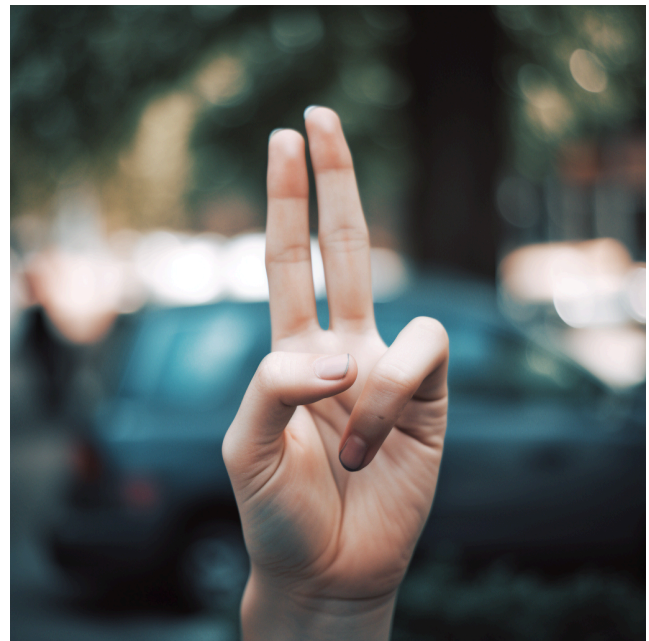
Figure 1. EE Journal #4: Art After AI, AI generated image “Four is More”, from AI generated fictional exhibition “Fingerless & Limitless”.

The interview “Fingers for Diversity” was crafted based on a prompt for ChatGPT to come up with a fictional yet convincing narrative of why Midjourney has ongoing difficulties in visualizing realistic human hands and fingers. [10] One of the fictional explanations that ChatGPT offered was that instead of being a technical difficulty or error, it could actually be a conscious decision by the company. In the spirit of large tech companies functioning as black boxes, this reasoning resonated with us, and we prompted ChatGPT to write an interview with a fictional AI expert who has insights into the issue at hand. The fictional persona David Johnson then explains that: “it’s their responsibility as a company to use the image generating tool to promote diversity and positive body representation.”