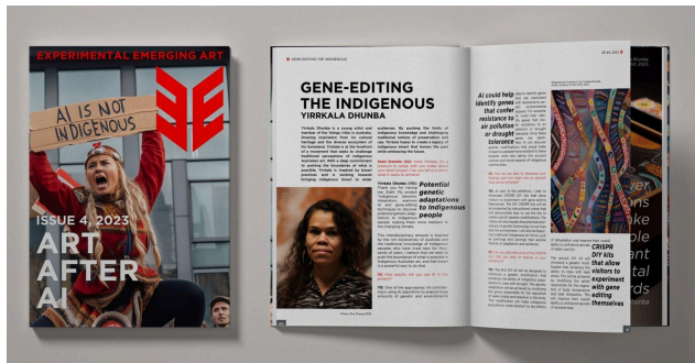
Figure 1. EE Journal #4: Art After AI, Interview “Gene-Editing The Indigenous” with fictional artist Yirrkala Dhunba.

internet sources, leading it to echo mainstream narratives and potentially perpetuate societal biases. For instance, the surprising repetitiveness in its responses indicated a tendency to gravitate towards commonly discussed ideas rather than venturing into uncharted territories. While this often aligns with popular culture, it might inadvertently reinforce existing stereotypes or neglect lesser-heard voices and perspectives. This is also visible in the previously discussed interview with a fictional indigenous artist, Yirrkala Dhunba. While ChatGPT came up with an artwork that can be seen as highly innovative in the indigenous art community, at closer inspection, it is also clear that climate resilience amongst indigenous communities is very pressing and trending. The resulting images by Midjourney also exposed the visual biases of individuals from indigenous communities.